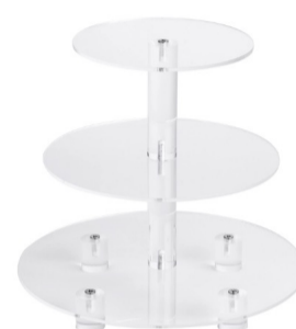
Three Tier Cupcake Stand (Holds up to 28 cupcakes) $5