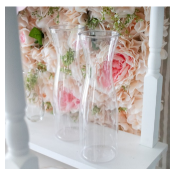
Carafe, Plastic 3 available $1 each Add spring water +$2