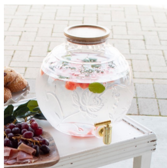
Large Clear Beverage Dispenser w/Bamboo Lid Plastic 2 available $5