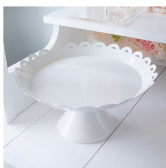
White Scalloped Edge Large Cake Stand, Metal $3