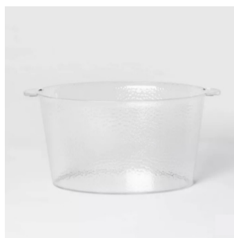
4 gal Beverage Tub Clear, Plastic $2