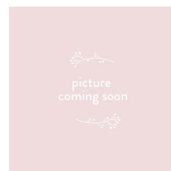
Cake Pop Holder (Holds up to 21 cake pops) $3