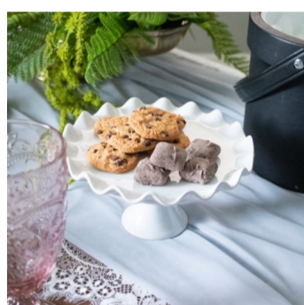
Small Ruffle Edge Cake Stand Ceramic $2