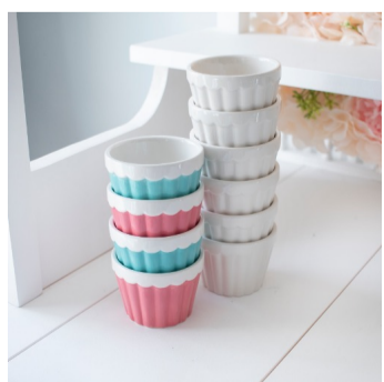
Dip Cups Small (pictured) Medium $.50 each