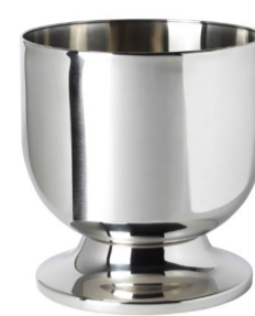
Wine Cooler, stainless steel 8"