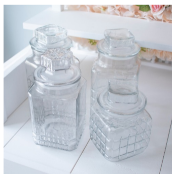
Candy/ Snack Jars, Glass 4 available $2 each