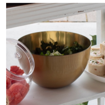
Gold/Brass Medium Large Serving Bowl 2 Available $3