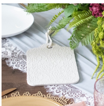
Small Ceramic Cheese Plate $1

If you need more than the quantity listed, please let us know how many more and of what item. We may be able to source as many as you need!