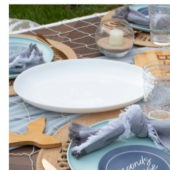
White Platter Med/Large $3