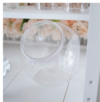
Clear Bins with scoop, plastic 2 Available $2 each