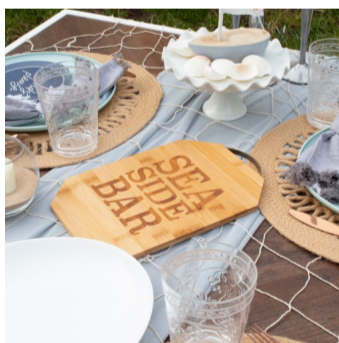
Sea Side Bar Cheese Board Small $2