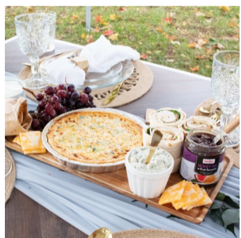
Wooden Platters 2 large/med $4