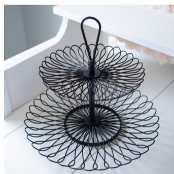
2 Tier Black Stand, Wire/Metal $2