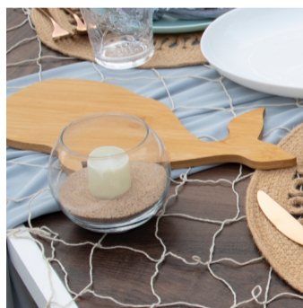
Whale Shaped Cheese Board Small $2