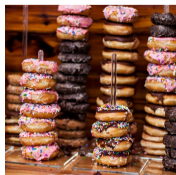
Clear Donut Stands, Plastic (4 tall, 4 short available) $2 each