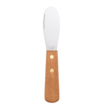
Mini Metal + Wood Spreader $.50 each